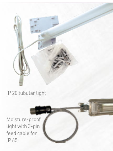
IP 20 tubular light

OPTIONAL: • Pit control unit with, for example, emergency stop, light sensor, emergency call button and socket, fully wired • Tailored connecting cables from the machine room switch cabinet to the pit control unit (10 m + height of shaft) • Halogen-free versions available (not IP 20)